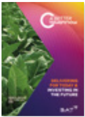
Annual Report 2019