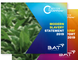
Modern Slavery Statement and UK Gender Pay Report 2019

Our Annual Report 2019 provides details of our evolved Group strategy, with sustainability at its heart. This includes our clear corporate purpose to build ‘A Better Tomorrow’ by reducing the health impact of our business through offering a greater choice of enjoyable and less risky products.