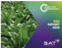
ESG Report 2019