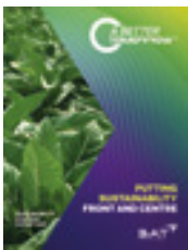
Sustainability Strategy Report 2019